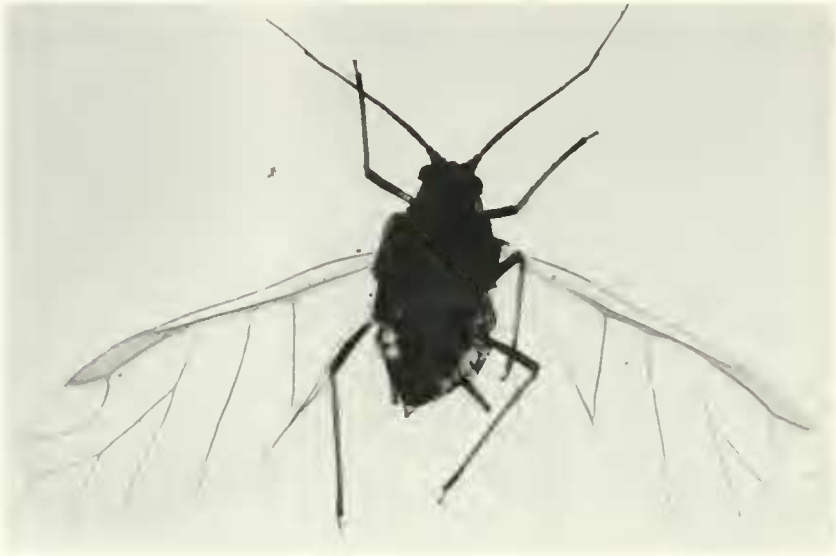
Fig. 5. Cotype of Kakimia mimulicola , slide from Essig Collection at U.C. Berkeley (6.25 \times ).

dae (Davis) and for which it would be an older name. We think it is undesirable to replace a well known and appropriate name with a previously unrecognised and inappropriate name and will request the International Commission on Zoological Nomenclature to suppress the name scrophulariae .